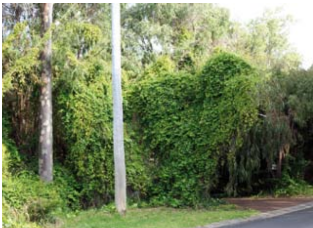
Margaret River townscape streetscape - weeds include Spotted Gum, Ironbark, Victorian Tea Tree, Dolichos Pea, Morning Glory, Ivy.