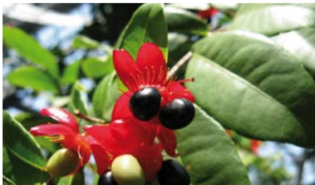
Mickey Mouse Plant, Ochna Serrulata